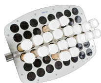
PRS-48 BS-010118-CK platform

14 tubes 20-30 mm diameter (50 ml tubes).