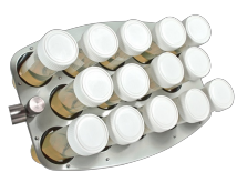
PRS-14 BS-010118-BK platform

14 tubes 20-30 mm diameter (50 ml tubes).