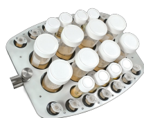
PRS-8/22 BS-010118-AK platform

48 tubes 10-16 mm diameter (1.5 ml-15 ml tubes).